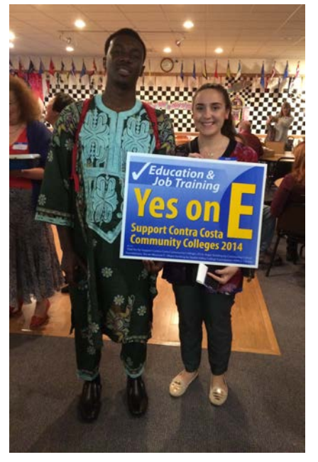
DVC students campaign at the DVCRA spring meeting for Proposition E, which successfully passed.